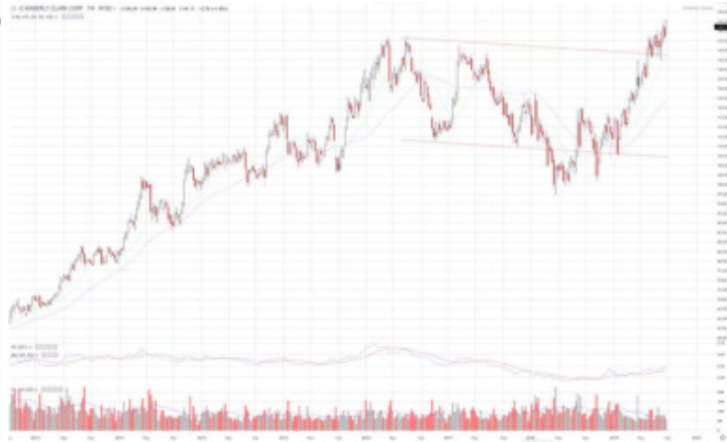
Household Products: KMB