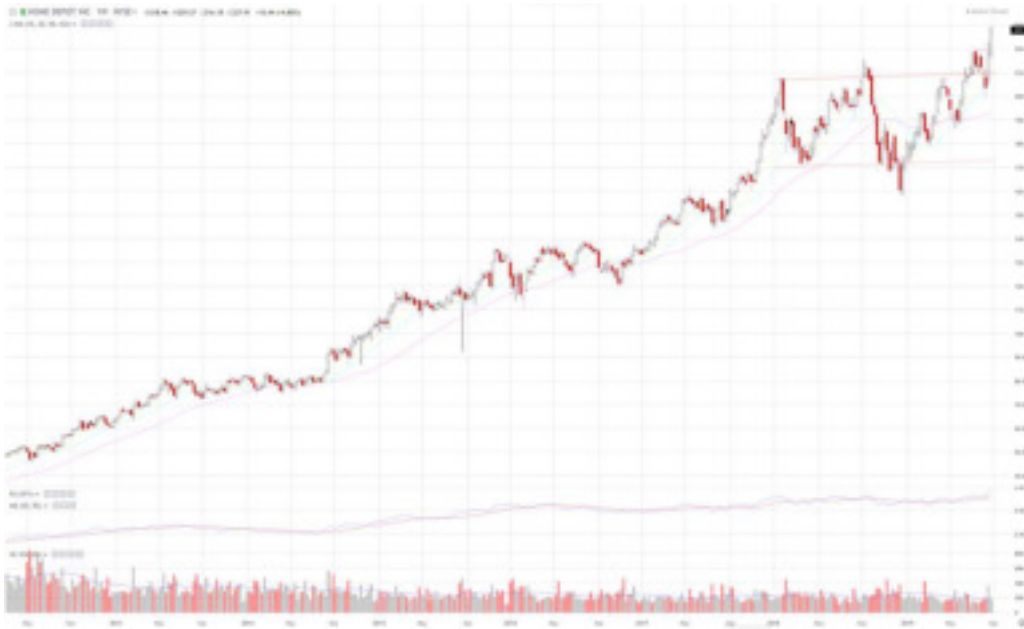
Home improvement: HD