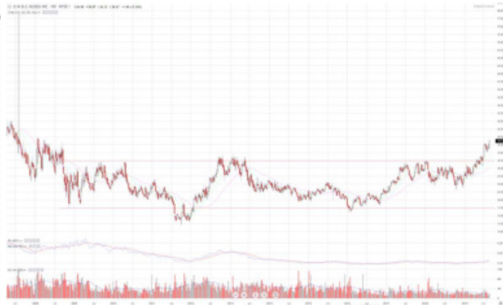
Homebuilders: MDC, MTH