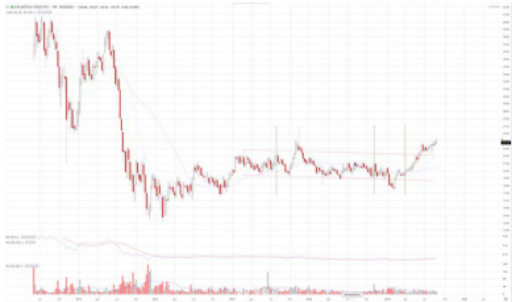
Renewable Electricity: AY