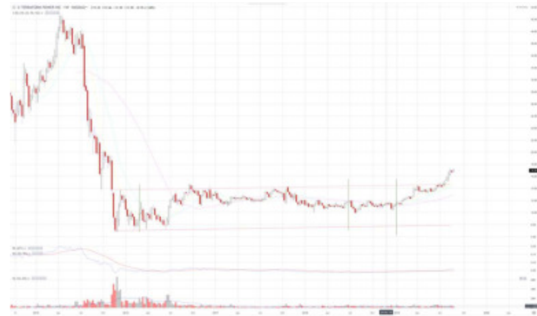
Renewable Electricity: TERP